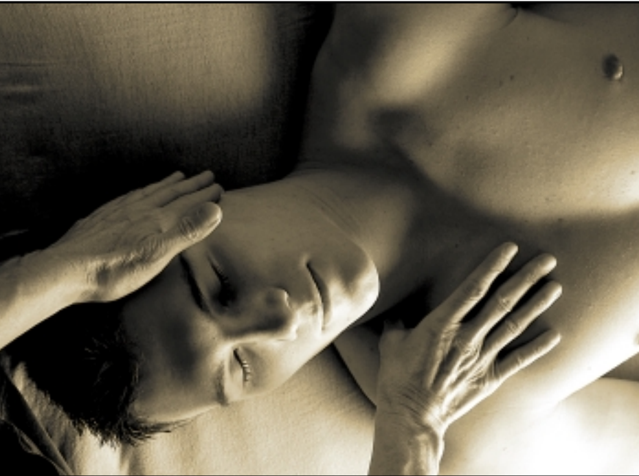
The author demonstrates a basic relaxation move for the neck and shoulders.

The body, like any intricate musical instrument, requires adequate tuning for correct function. When tuned properly, the body will resonate to create a distinctive tone and vibrational pattern that correlates with its own unique frequency.