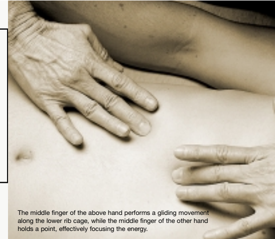
The middle finger of the above hand performs a gliding movement along the lower rib cage, while the middle finger of the other hand holds a point, effectively focusing the energy.

The body, like any intricate musical instrument, requires adequate tuning for correct function. When tuned properly, the body will resonate to create a distinctive tone and vibrational pattern that correlates with its own unique frequency.